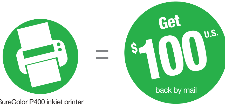
SureColor P400 inkjet printer

Purchase a SureColor ® P400 or SureColor P600 inkjet printer and receive the following back by mail: