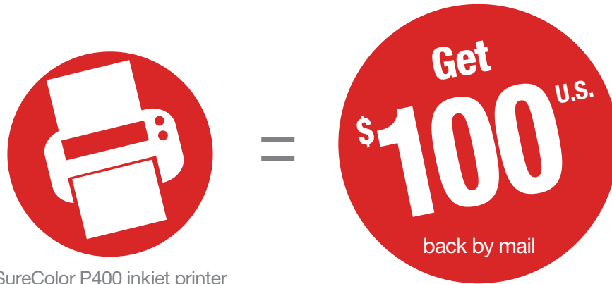
SureColor P400 inkjet printer

Purchase a SureColor ® P400 or P600 inkjet printer and receive the following back by mail: