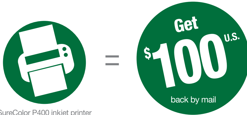
SureColor P400 inkjet printer

Purchase a SureColor ® P400 or P600 inkjet printer and receive the following back by mail: