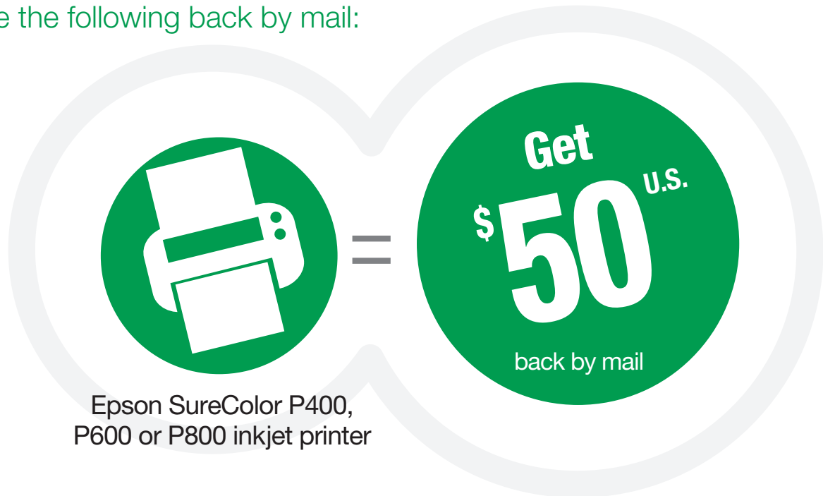
Epson SureColor P400, P600 or P800 inkjet printer

Buy an Epson ® SureColor ® P400, P600 or P800 inkjet printer and receive the following back by mail: