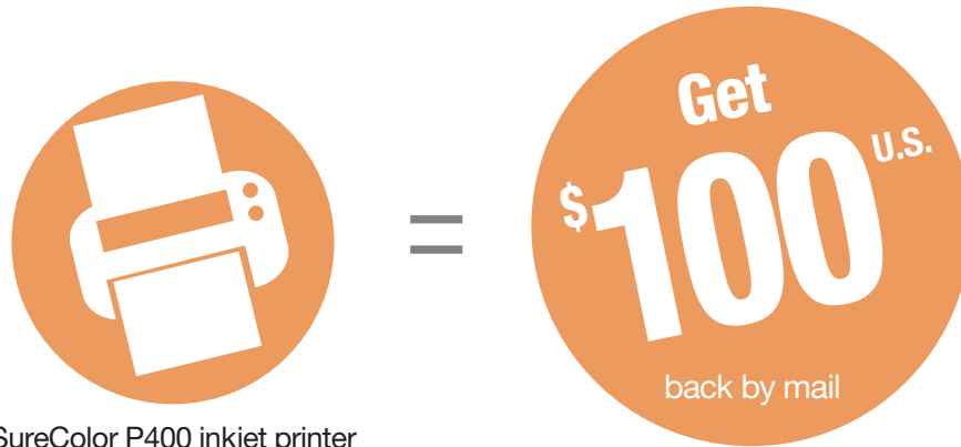
SureColor P400 inkjet printer

Purchase a SureColor ® P400 or SureColor P600 inkjet printer and receive the following back by mail: