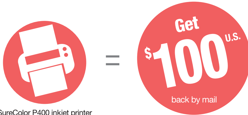
SureColor P400 inkjet printer

Purchase a SureColor ® P400 or SureColor P600 inkjet printer and receive the following back by mail: