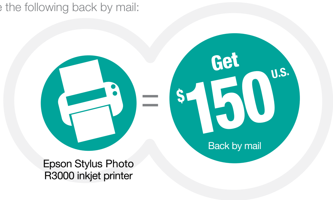
Epson Stylus Photo R3000 inkjet printer

CLAIMS MUST BE POSTMARKED WITHIN 30 DAYS FROM THE PURCHASE DATE. PRODUCT MUST BE PURCHASED BETWEEN 5/1/13 AND 6/30/13.