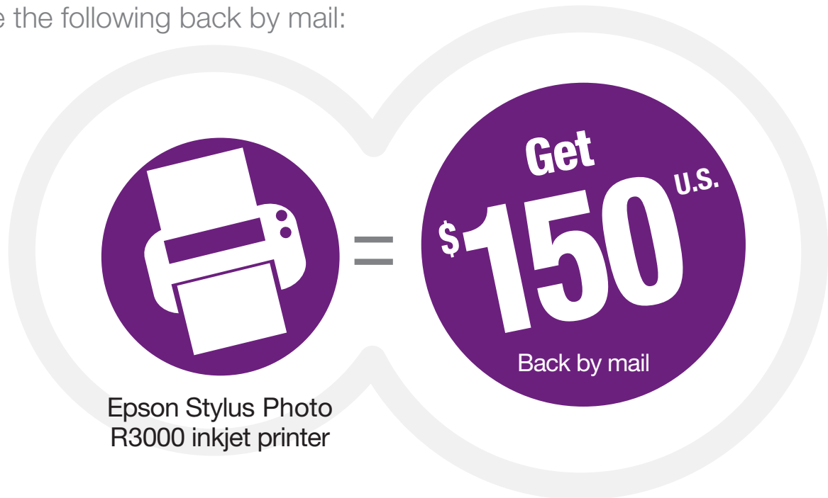
Epson Stylus Photo R3000 inkjet printer

Buy an Epson Stylus ® Photo R3000 inkjet printer and receive the following back by mail: