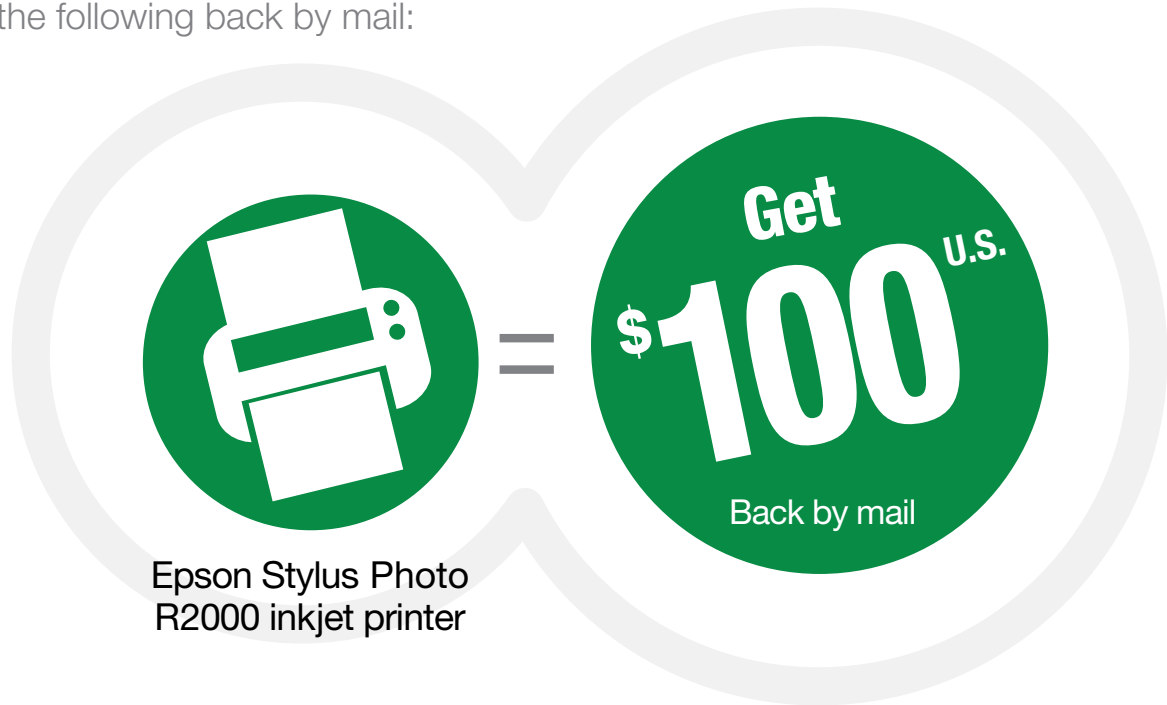
Epson Stylus Photo R2000 inkjet printer

Buy an Epson Stylus ® Photo R2000 inkjet printer and receive the following back by mail: